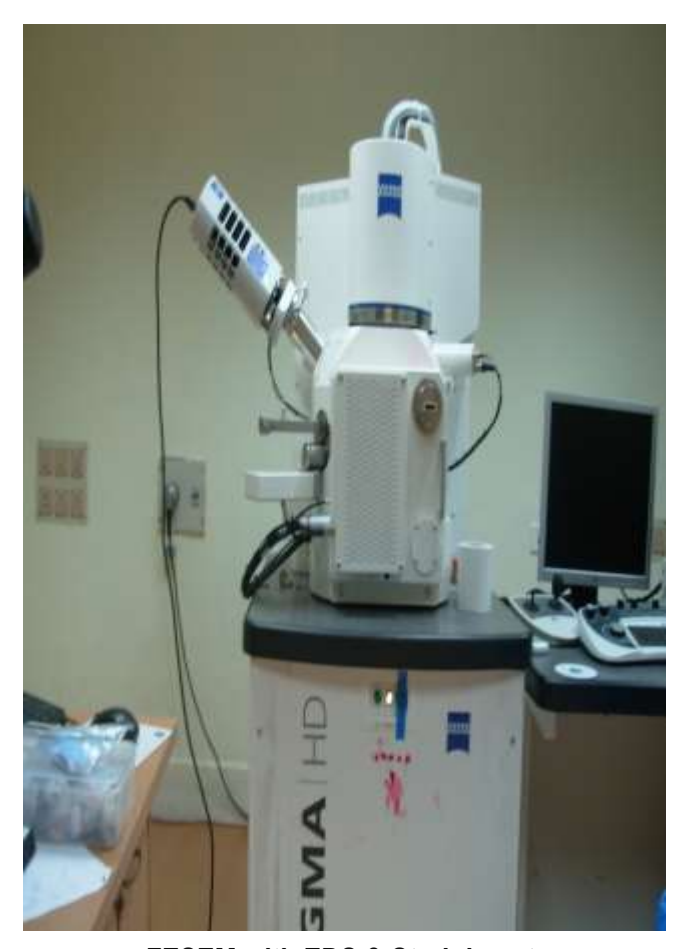
FESEM with EDS & Straining stage