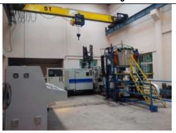
Rheo Pressure Die Casting Facility