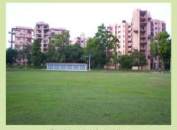
Residential Complex & Football Ground

The CMERI Staff Club is a meeting place for all members of the CMERI family. Be it the pursuit of recreation, or of an urge to take part in cultural activities, or simply for keeping fit through proper exercises, the Club premises serve as a desired destination. The Club houses two properly maintained badminton courts, has a Multigym facility, a Table Tennis board, and a horde of indoor games such as Carom, Cards, Chess, etc. The Club also has Library with a moderate holding. Adjacent to the Club Auditorium complex reposes a volleyball ground. Two fields are available at two corners of the Colony for outdoor games like football and cricket.