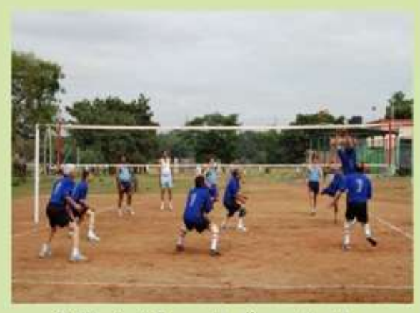
Volleyball Ground adjacent to the Academic Hall of Residence