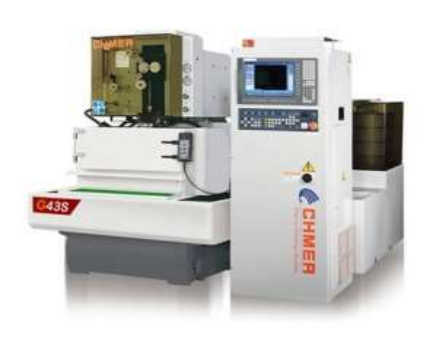
High Precision CNC Wire EDM -Submerged