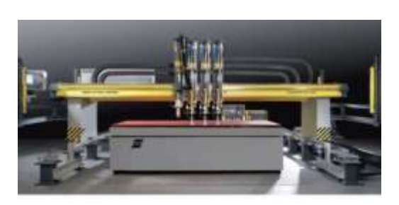
CNC Plasma Cutting System