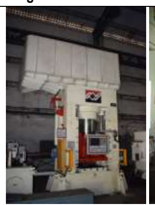
Hydraulic CNC & Conventinal Press