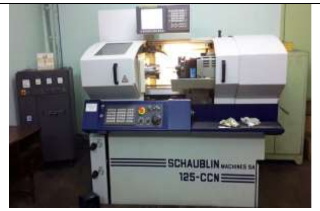
High Precision CNC Turn-Mill