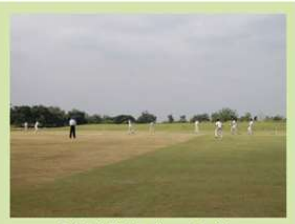
Cricket Field adjacent to the Academic Hall of Residence