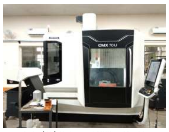
5-Axis CNC Universal Milling Machine